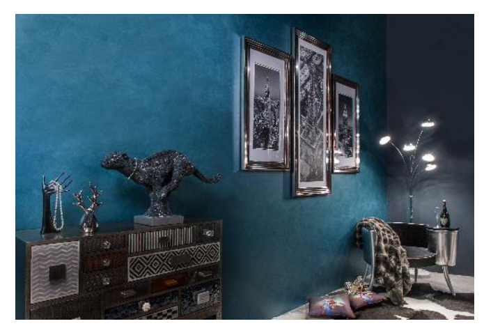
9 - Momento Velvet Pearl