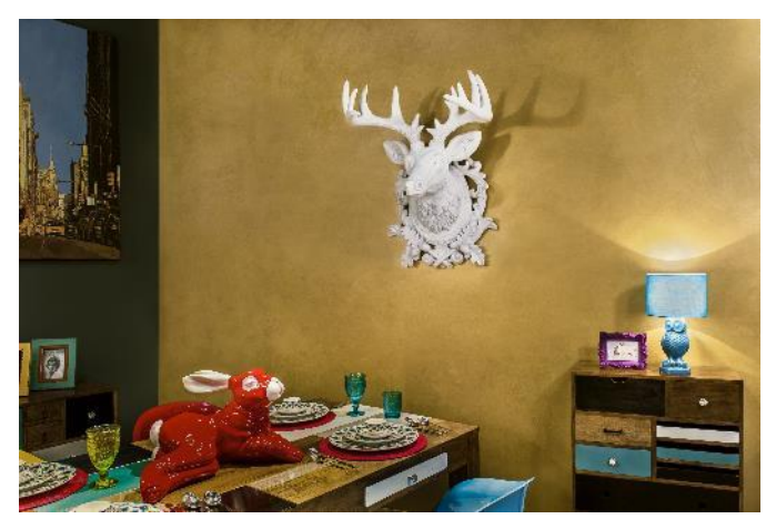
6 - Momento Velvet Metallic