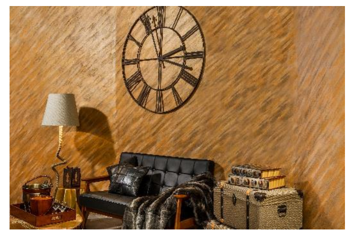
7 - Momento Rust Box