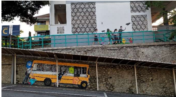
Old Bas Sekolah and Kapal Terbang Kertas: These two murals tell the story of the good old days, creating a sense of nostalgia amongst school leavers.