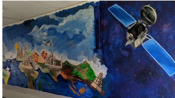
World Wonders: This mural aims to showcase the wonderful historical monuments from around the world.

According to R.E.A.L Schools, the murals are a reflection of R.E.A.L’s commitment to inspire students to explore lessons beyond books and classrooms. Most of the murals create a sense of nostalgia for school leavers by capturing the best school experiences. Beyond that, some of the murals are also educational and aim to educate students on global monuments and landmarks.