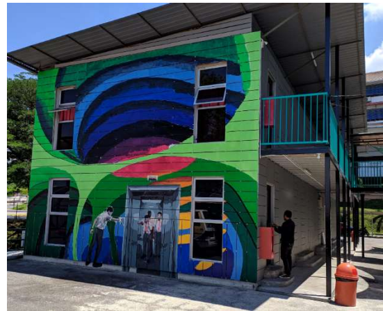
The Art Realm creates a great first impression by showcasing a building full of colours.